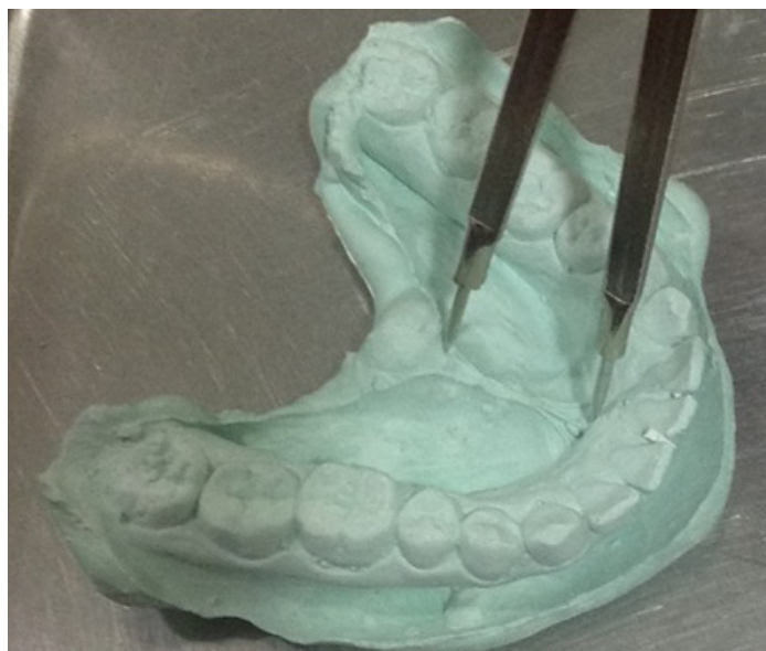
[Table/Fig-1]: Determination of Median lingual frenal length in a prediagnostic cast

The maximum mouth opening reduction was recorded in two steps. The patient was asked to open his/her mouth as wide as possible and the inter-incisal measurement (incisal margin of maxillary central incisor and mandibular central incisor) was determined. The patient was then requested to place the tip of tongue on the incisive papilla and the interincisal distance at this position was recorded again. The difference in the two values gave the reduced amount of maximum mouth opening [Table/Fig-2].